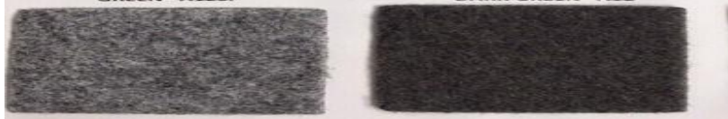
Grey Carpet included with your exhibit space