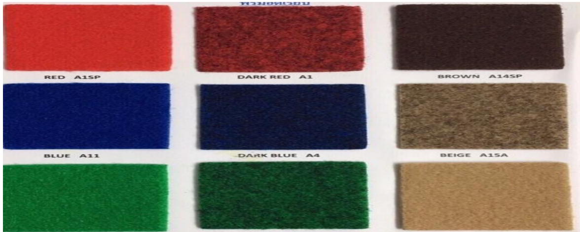
Should you wish to order different color at your own cost.