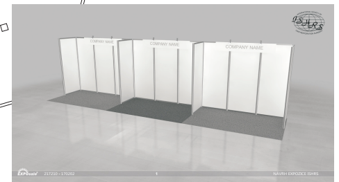
Booths are 2m deep and 3m wide

EXPOSale all for fairs and congresses variant 170210